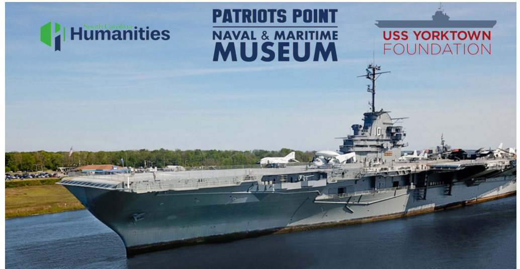
Patriots Point Naval & Maritime Museum

"This virus hit at the busiest time of the year for us. This money will help cover operational costs incurred while we were closed."