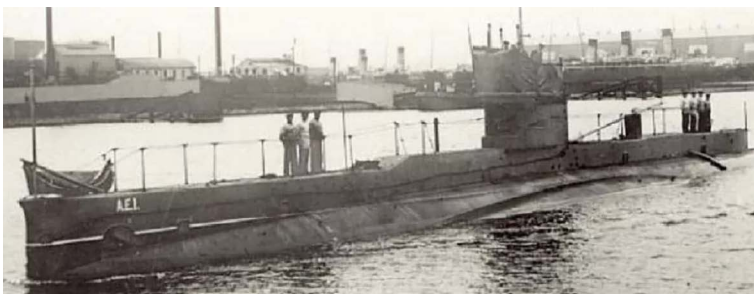
HMAS AE1