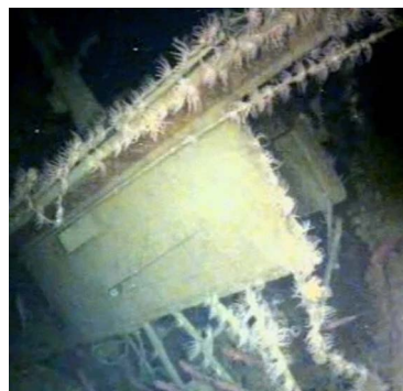
(Left) HMAS AE1 Wreckage

Australia's first submarine HMAS AE1 has been found, ending a 103 year maritime mystery.