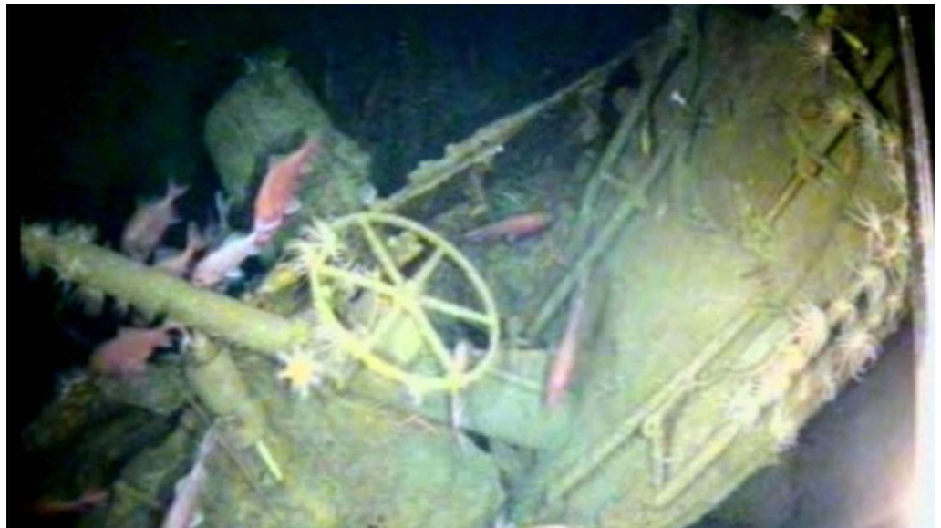
103 years since her loss, HMAS AE1 was located in waters off the Duke of York Island group in Papua New Guinea