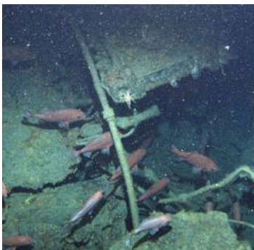
(Right) HMAS AE1 Wreckage