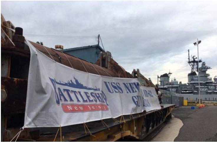
The Big Guns Return to BB 62 (Battleship New Jersey Photo)

Just before dawn on January 29, two of the USS New Jersey's historic WWII 16-inch gun barrels arrived at the Battleship on oversized Norfolk Southern rail cars. The third barrel arrived across